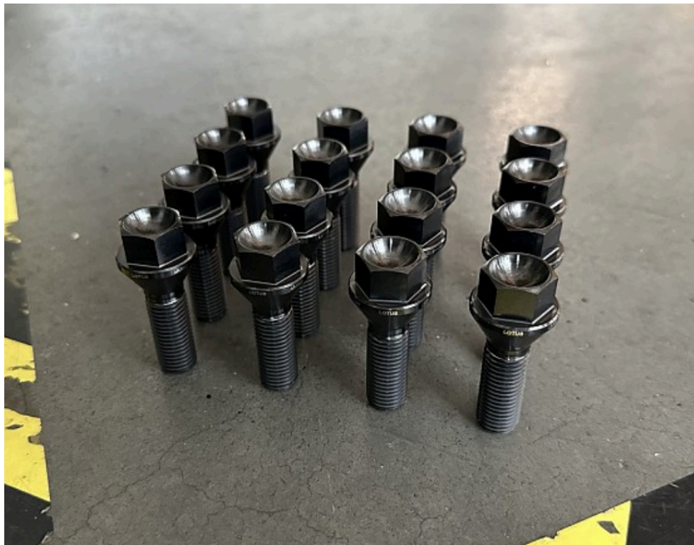
Fig 1: Scope of delivery