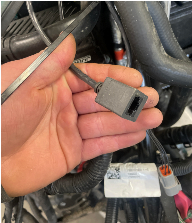
Fig 3: Connect your LAN-cable (3) to the LAN-socket.