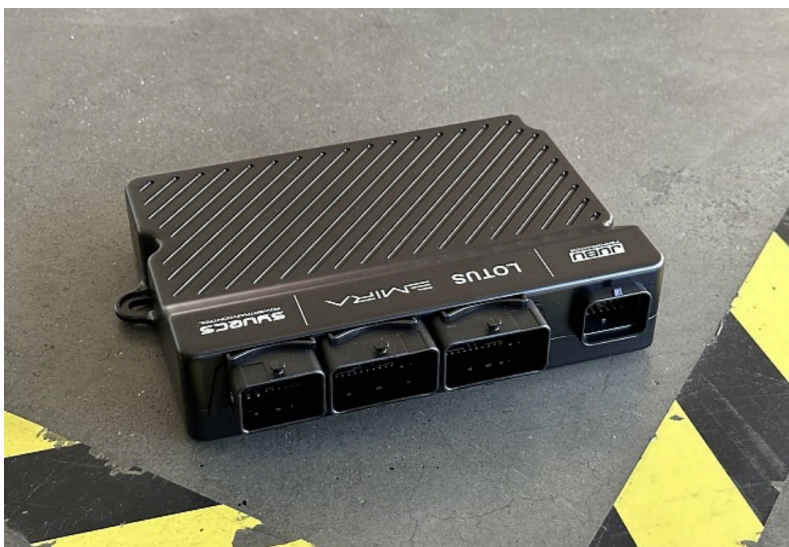
Fig 1: Syvecs ECU