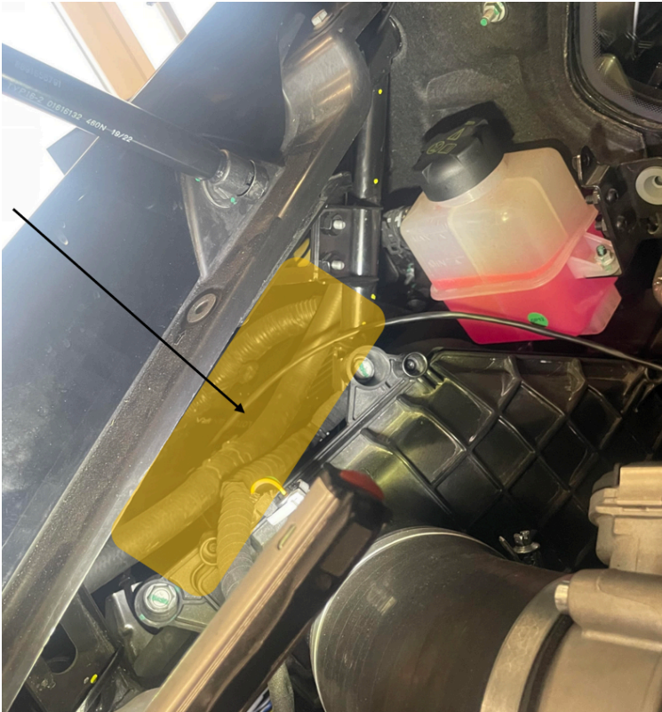
Fig 2: The LAN-socket (connected to the ECU via cable) is located in the yellow marked region.