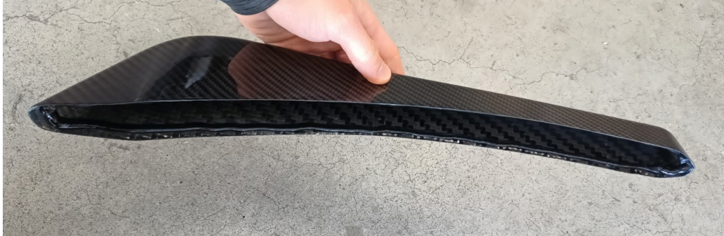
Fig 2: Adding bodywork adhesive on the diffuser fins.